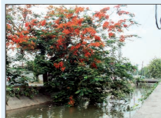
The Glorious Gulmohar in Bloom

Vol. 9 No: 136 | JAMMU, THURSDAY, MAY 18, 2017 | Pages: 12 | Price: ₹ 3.00 | Air surcharge 50 paisa for Leh