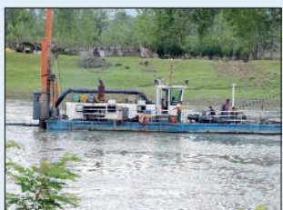
Sham Choudhary for speeding up dredging works in Jhelum