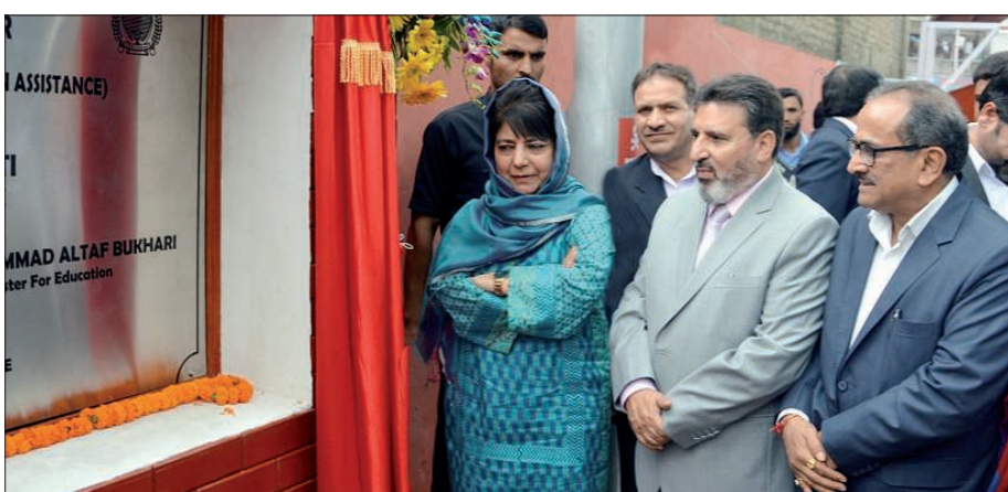
Chief Minister Mehbooba Mufti flanked by her Deputy Dr Nirmal Singh and Cabinet Minister Altaf Bukhari inaugurating semi-mechanized car parking facility in Srinagar on Wednesday.